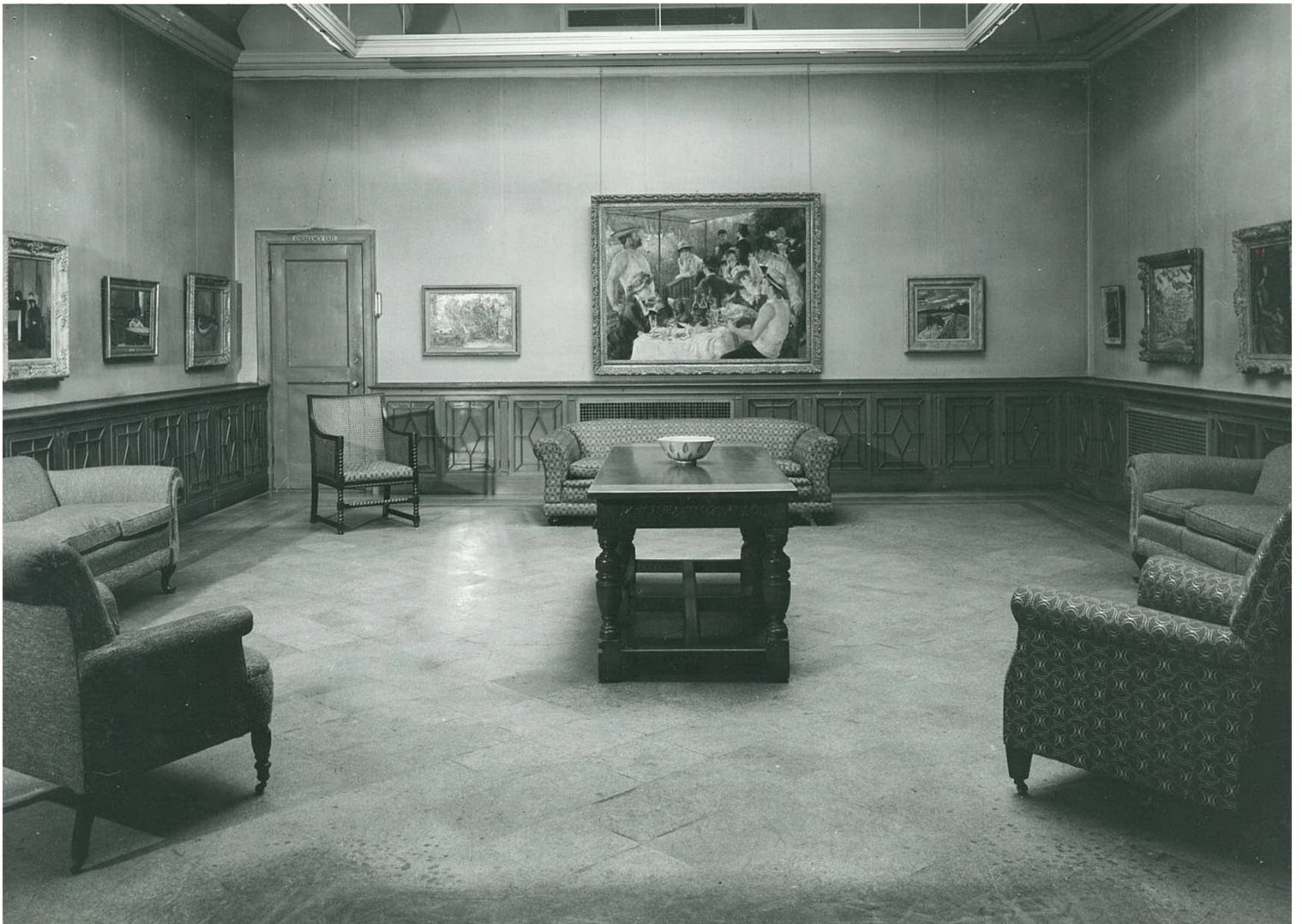
BOTTOM: The Main Gallery in 1941